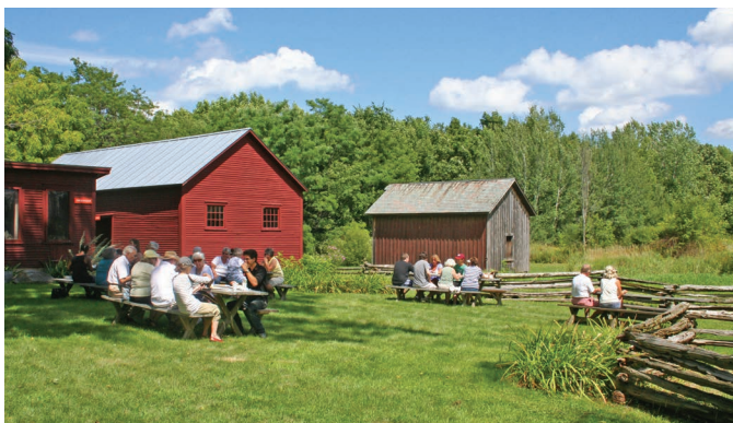
Picnic tables offer a place to enjoy lunch outside or to just sit and take in the view.