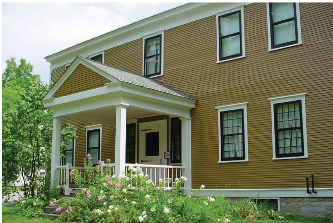
Tours of the Robinson family home may be arranged by special request.